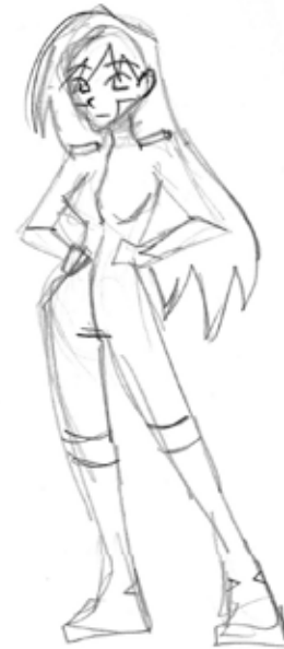
Concept Art: Eve